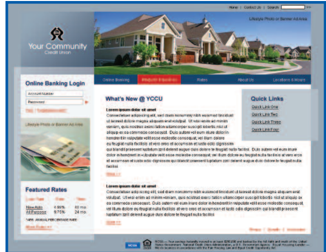
Design Sample - Other designs available