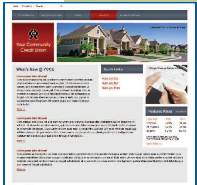
Design Sample - Other designs available