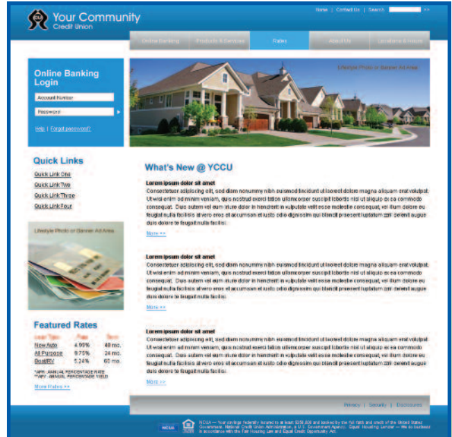
Design Sample - Other designs available