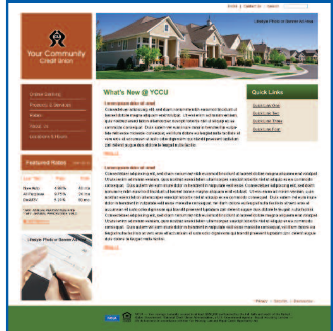
Design Sample - Other designs available